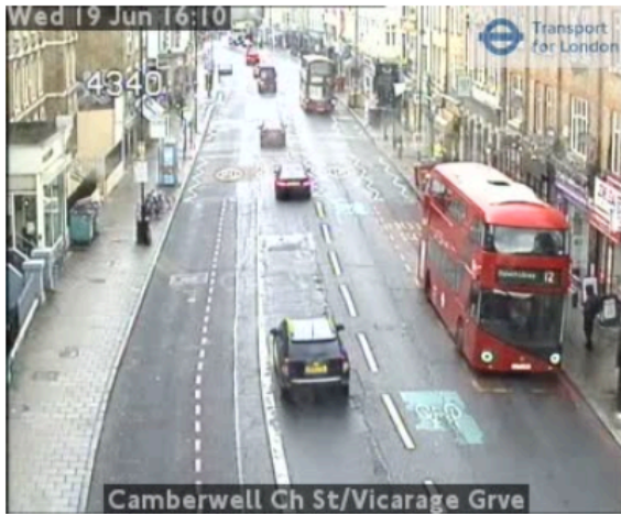
Enemy Vehicle Status